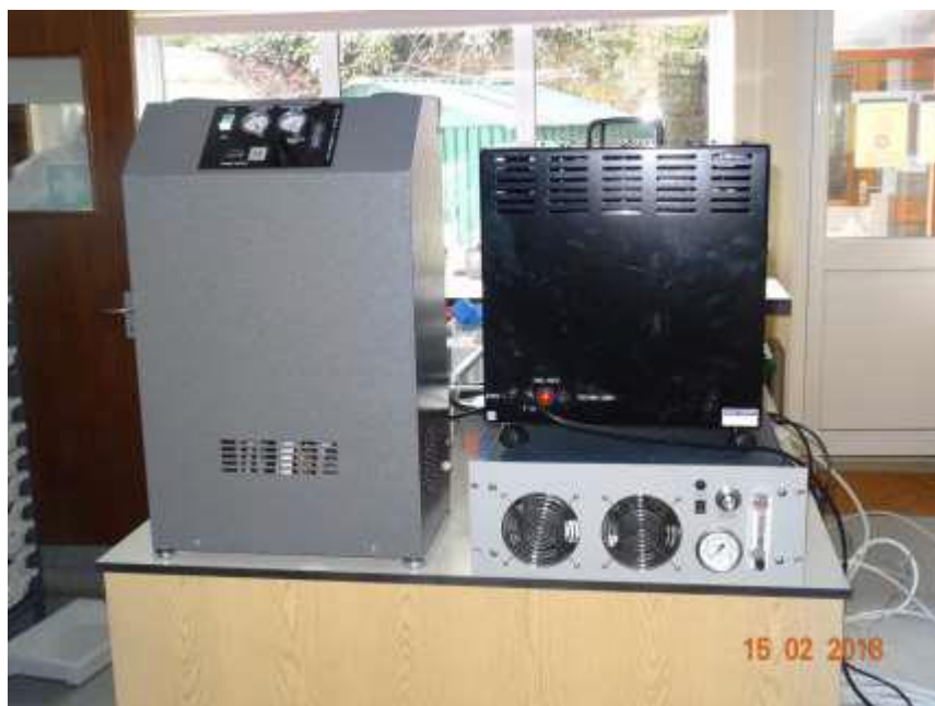
Ozone generators at 800ppm using nitrogen free air to sanitise air and some surfaces