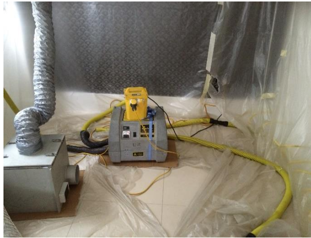
Using vacuum systems to dry and decontaminate