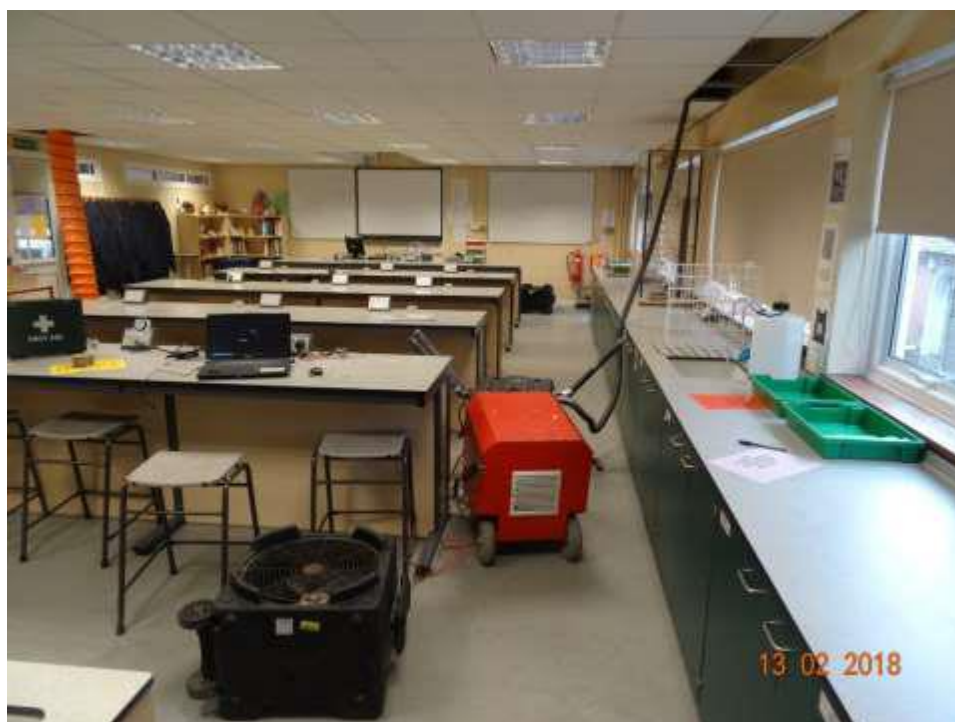
Gas phase oxidising agent used over 5 -10 days