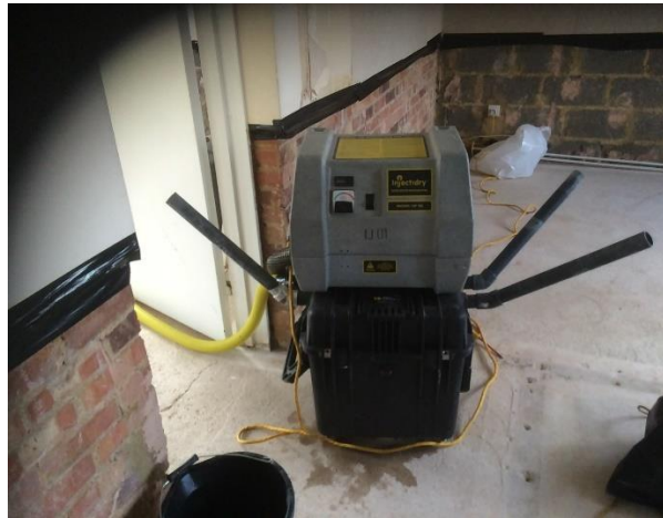
Vapour phase oxidising agent introduced into air and cavities