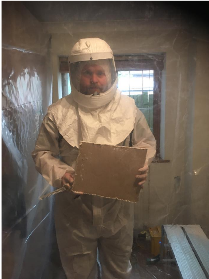
Working within critical barriers with PPE